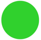
Columbus Legal Aid